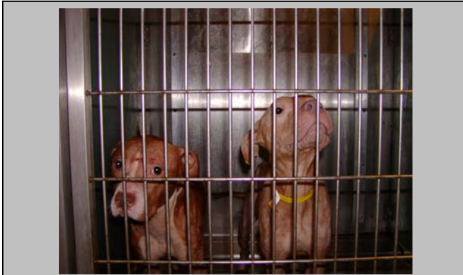
Spain and Teddy (left to right) impounded at SEAACA Shelter. Both dogs were rescued by SEAACA from a boarding facility that severely neglected and starved 67 dogs on their premises. Spain and Teddy are emaciated and had lost over 80% of their fur.